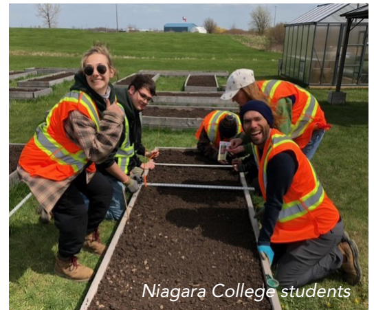
Niagara College students

"I heard firsthand how much it meant to people to be able to walk away with produce they otherwise could not afford. I heard the excitement of making toasted tomato sandwiches, butternut squash soup, adding fresh greens to dinner and just having pears on hand for a mid-day snack."