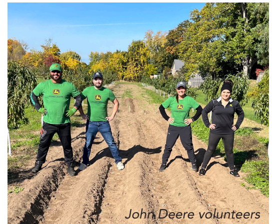
John Deere volunteers